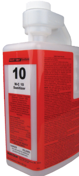
M-C 10 Sanitizer Food service, no rinse sanitizer. Sanitizes in 60 seconds.