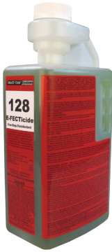
128 E-FECTicide Rapid Kill Disinfectant Concentrated makes 272 quarts Kills MRSA, Influenza Kills Norovirus