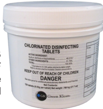
GK Chlorinated Tablets Kills C-DIFF Hospital grade Economical