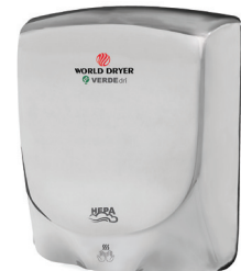
Stainless Steel , Polished