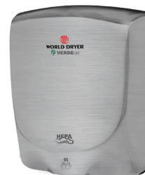
Stainless Steel , Brushed