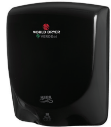
Aluminum , Black