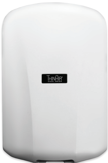
TA-ABS White Polymer (ABS)