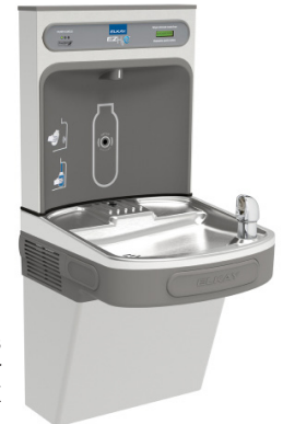
Models LZS8WSVRSK or LZSDWSVRSK