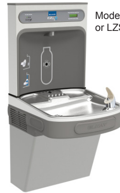
Models LZS8WSLK or LZSDWSLK