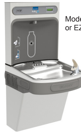
Models EZS8WS or EZSDWS

**Based on 80°F inlet water & 90°F ambient air temp for 50°F chilled drinking water.