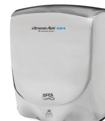
Stainless Steel Polished