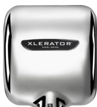
XL-C Chrome Plated