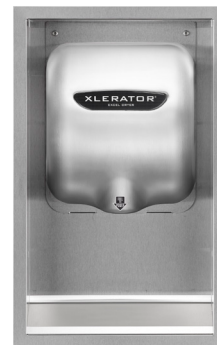
Part # 40502