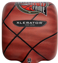
XL-SI5 Custom Special Image