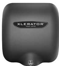
XL-GR Graphite Textured Painted