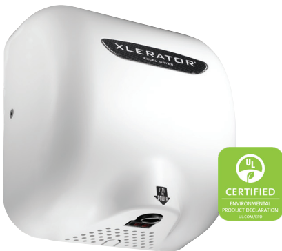
XL-BW White Thermoset Resin (BMC)