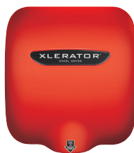
XL-SP4 Custom Special Paint