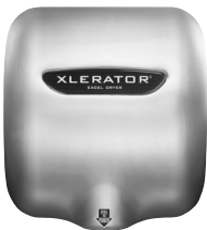
XL-SB Brushed Stainless Steel