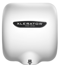
XL-W White Epoxy Painted