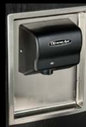
ADA-RK RECESS KIT