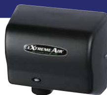
Steel Black Graphite