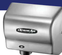
Steel Satin Chrome