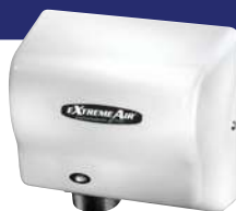
Steel White Epoxy