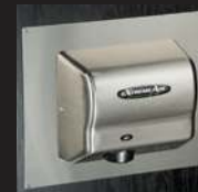
AP ADAPTER PLATE