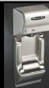
ADA-WG WALL GUARD